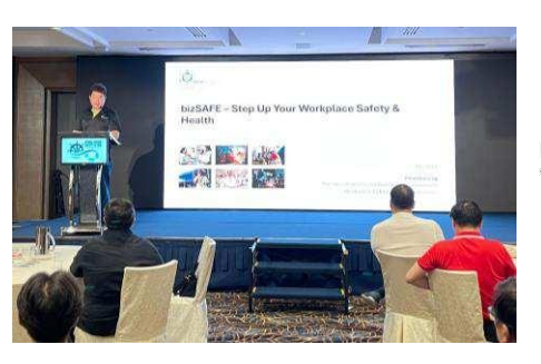
bizSAFE presentation at Pleasure Craft Safety Working Group Forum

Promoted bizSAFE at Pleasure Craft Safety Working Group (Apr 2024). To further reach out to supply boat operators and Clifford Pier Motor Group Association.